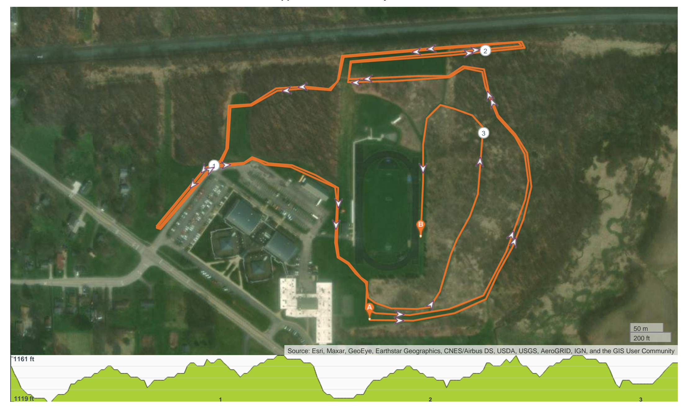
Clipper HS Cross Country Route